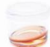
DISTILLATE Refined cannabinoid oil that is typically free of taste, smell & flavor. It is the base of most edibles and vape cartridges