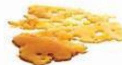
SHATTER A translucent, brittle, & often golden to amber colored concentrate made with a solvent