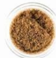
BUBBLE HASH Uses water, ice, and mesh screens to pull out whole trichomes into a paste-like consistency