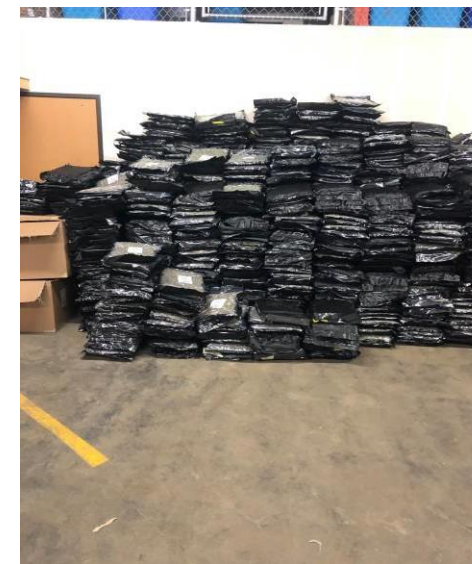
1745 POUNDS + 60 POUNDS OF THC IN DAWSON COUNTY PACKAGED AS COFFEE