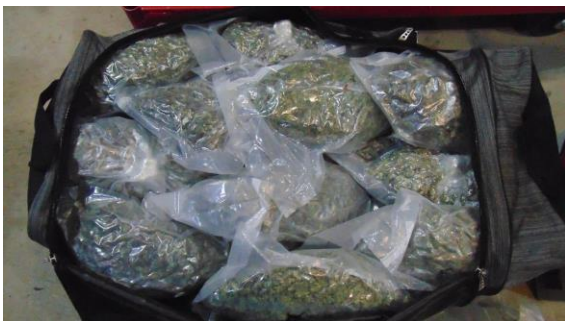
60 POUNDS NEAR BRADSHAW