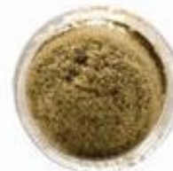
DRY SIFT Ground cannabis filtered with screens leaving behind complete trichome glands. The end-product is also referred to as kief