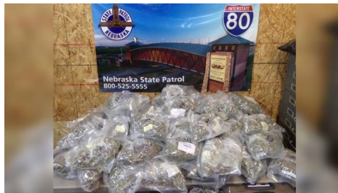
49 POUNDS NEAR KEARNEY