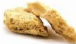
CRUMBLE Dried oil with a honey-comb like consistency