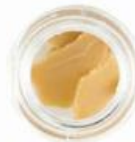
ROSIN End product of cannabis flower being squeezed under heat and pressure