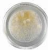
CRYSTALLINE Isolated cannabinoids in their pure crystal structure